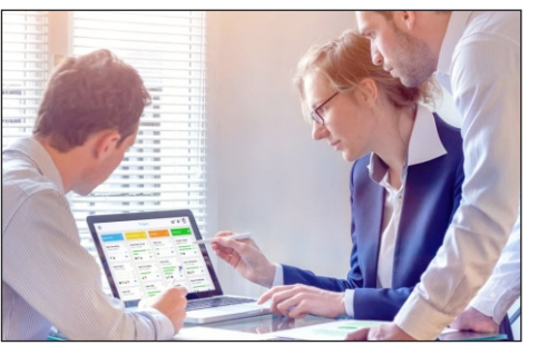
Finance Services Import & Export E-Money Services